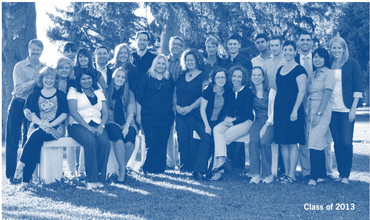
Class of 2013

For more information about these opportunities, visit leadershipwaterlooregion.org , e-mail info@leadershipwaterlooregion.org or call 519-742-7338.